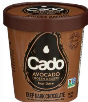
DEEP DARK CHOCOLATE